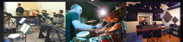
In The Studio